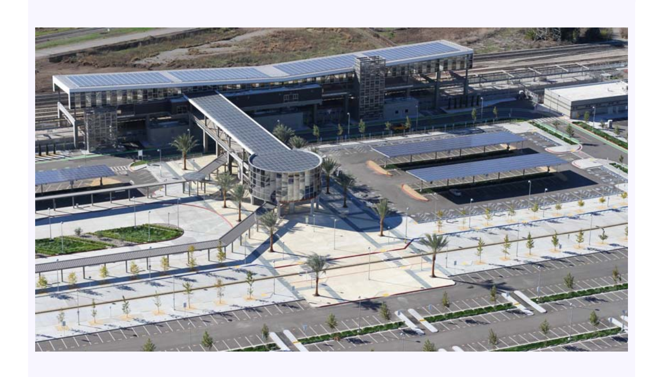
Passenger service to the Warm Springs / South Fremont Station is expected to begin March 25, 2017

The BART Warm Springs Extension is clearing final hurdles of the project. Since the beginning of the project, BART's project team has endeavored to balance the need to complete the work on time, on budget and to meet design specifications, function and quality, while maintaining project safety standards and minimizing construction impacts to the community.