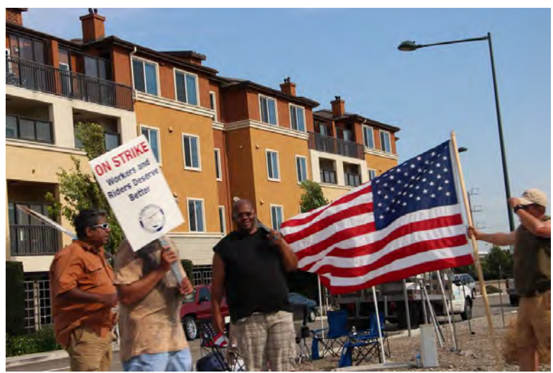
"Striking BART workers in Dublin, CA"