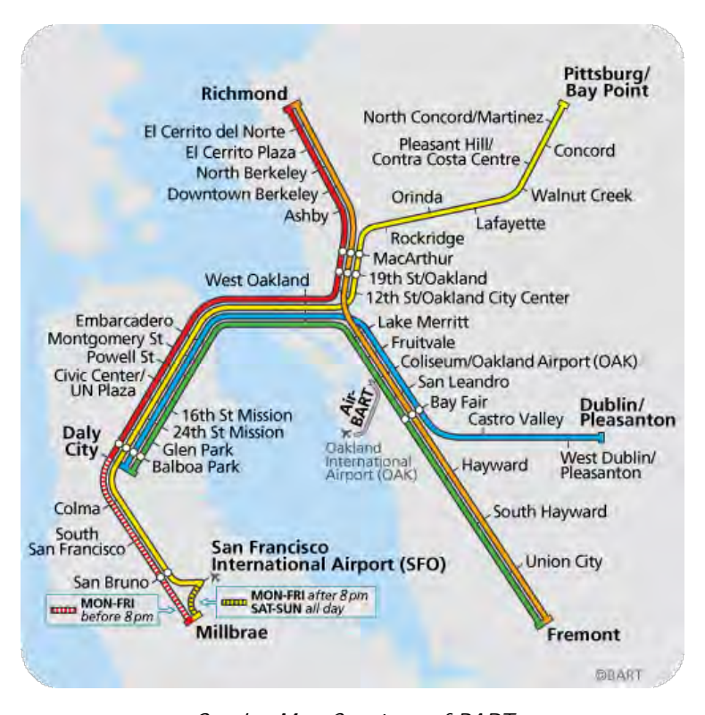
Service Map

BART serves the San Francisco Peninsula and East Bay--26 cities in all--with over 104 miles of track and 44 stations.<sup>2</sup> BART's fleet consists of 669 vehicles, which carries an average of more than 400,000 riders per weekday and is the fifth busiest heavy rail rapid transit system in the U.S.<sup>3</sup>