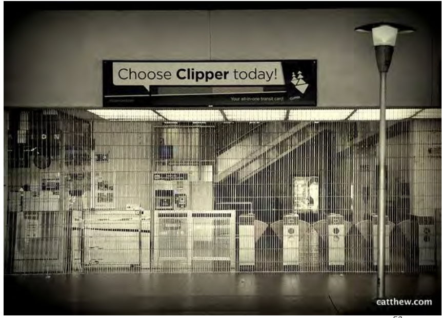
"MacArthur BART Station on the first day of strike"