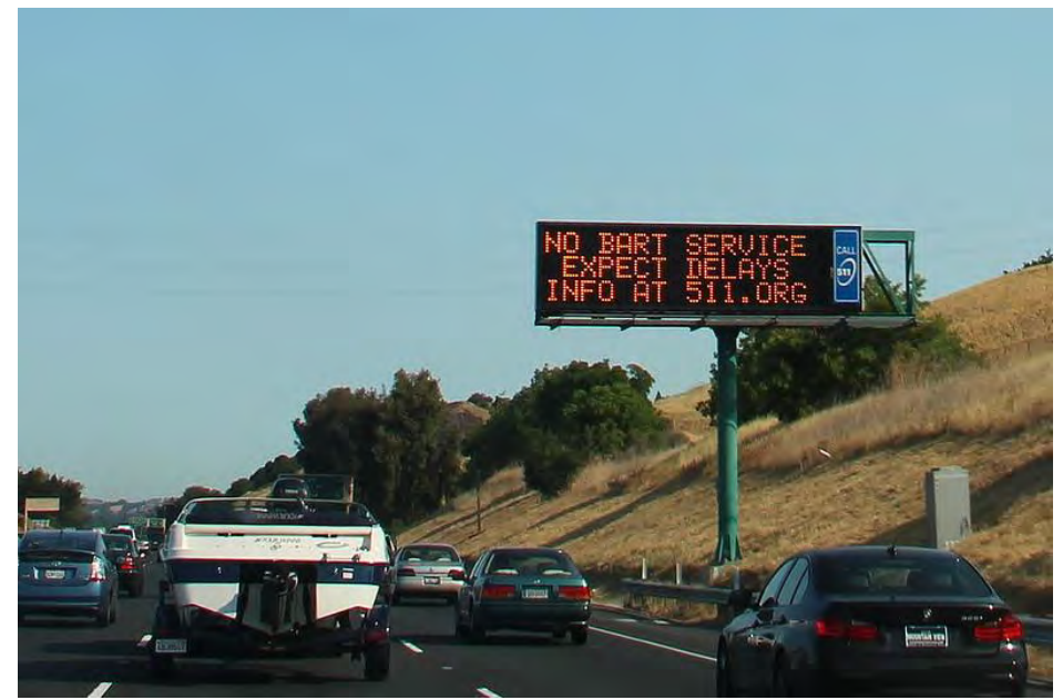
"Amber Alert Sign with the BART Strike Info"