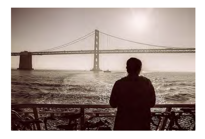
"Another Way to Work - Another bart strike forced a lot of commuters to find alternative ways to go to work. I chose the ferry." by Sonny Abesamis<sup>21</sup> is licensed under CC by 2.0