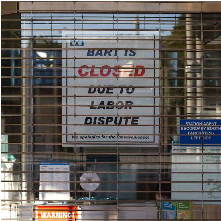
"Dispute"