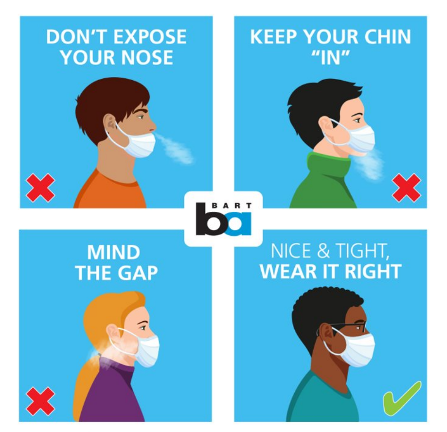
For more info, visit bart.gov/welcomeback