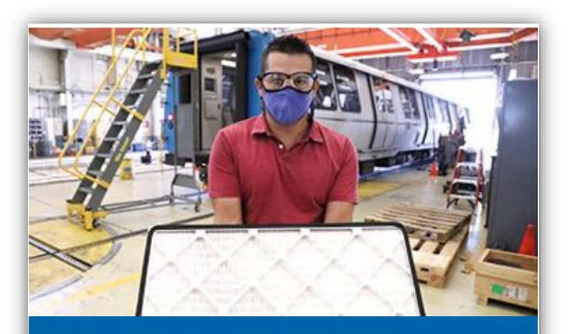
Ventilation On BART What you need to know about airflow and filters