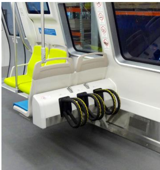
Bike Space Option on New Train Cars